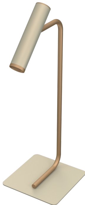
Table lamp with adjustable optical group. Technical lighting that blends with the decorative, industrial and minimal style.

Lampada da tavolo con gruppo ottico orientabile. Illuminazione tecnica che si fonde con il decorativo, stile industrial e minimal.